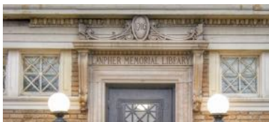
Lanpher Memorial Library