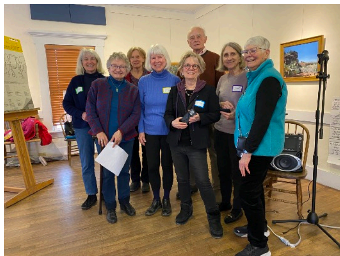
The iPhone Photography Group, absent Wendy Jacobson