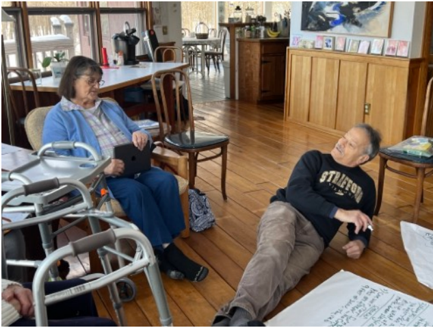
Photos from the Celebrating Connection workshops.